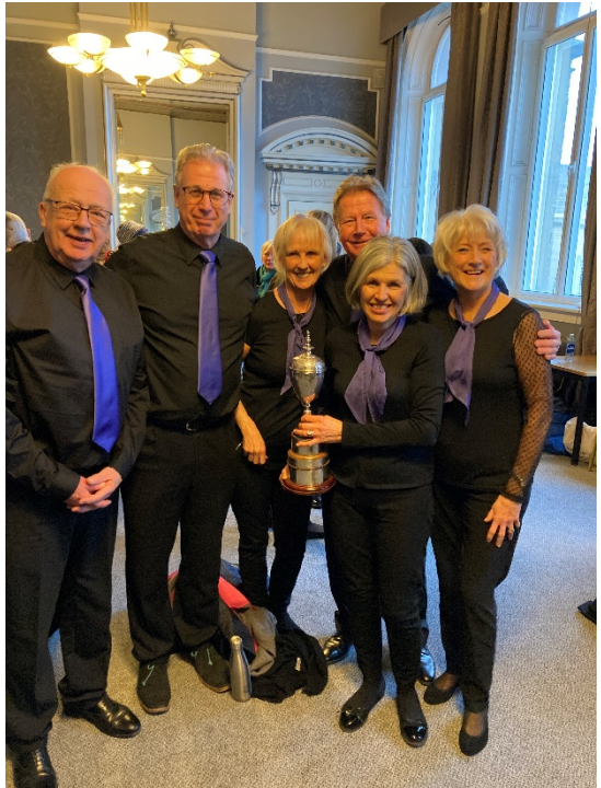
Six happy winners holding one of the trophies

We work towards and perform every year in The Huddersfield Mrs Sunderland Performing Arts Festival in February and have had much success.